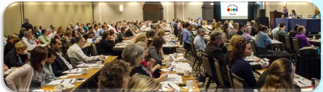
Hundreds of SCHC Meeting attendees fill a hall to hear experts in the field.

Did you know that SCHC is an eco-friendly organization and holds paperless events? All of our attendees have access to the SCHC App to obtain meeting info and network with others. Their daily interaction increases the number of sponsor impressions shown before, during, and after the event.